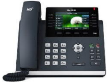
Yealink T4 series